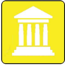
Governance and Policies