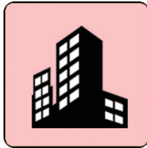
Common Infrastructure and Services