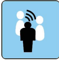
Awareness Raising and Capacity Building