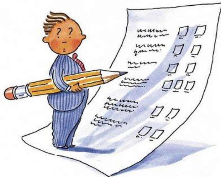
CP-IDEA - Questionário 2013