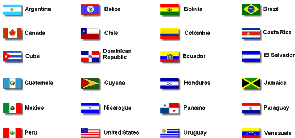
Figure 1: member countries of CP-IDEA

The Committee is currently formed by 24 American countries (Figure 1) and, as established at the 9th UNRCC-A (2009), Brazil is in charge of the Presidency and the Executive Secretariat for the 2009-2013 period.